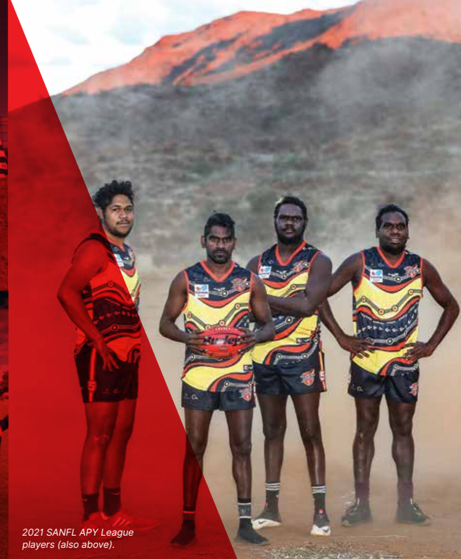
2021 SANFL APY League players (also above).