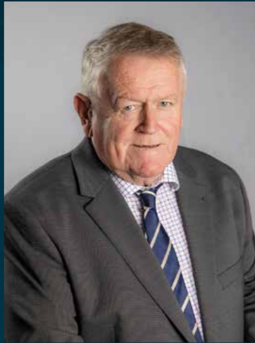
The Hon Rob Kerin Chairman, South Australian Football Commission