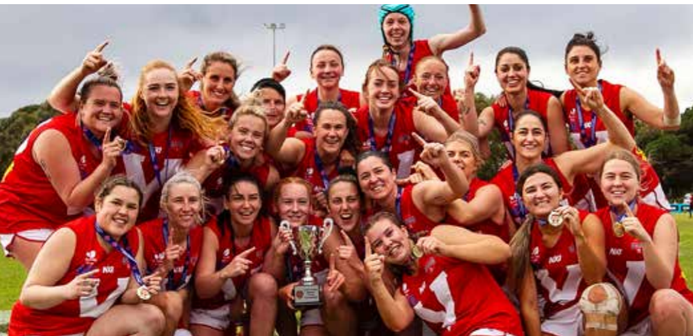
(Left) 2021 Women's SA Country Champions - Northern.