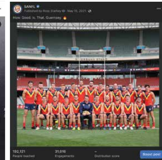
SANFL's social media channels continue to grow audience size and engagement levels.

Active SANFL App users reached 72,700 in 2021 and is expected to grow in 2022.