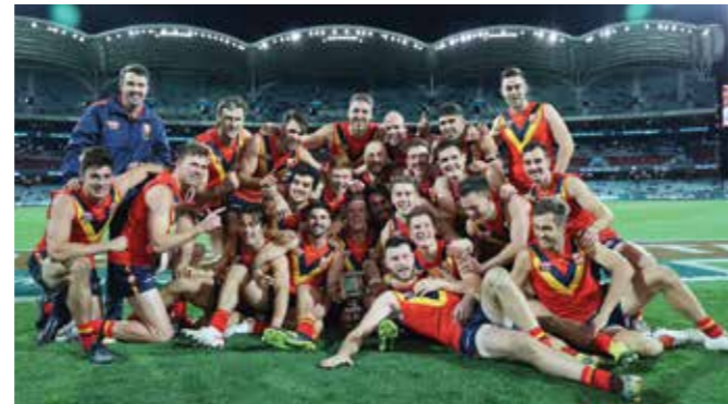
2021 Haydn Bunton Junior Cup winners, SANFL State Team.

A spirited third-term surge ensured the West End State Team would retain the Haydn Bunton Junior Cup with a 53-point win against the WAFL at Adelaide Oval in May.