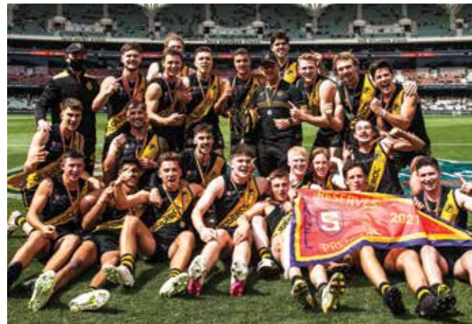
2021 SANFL Reserves winners, Glenelg FC.