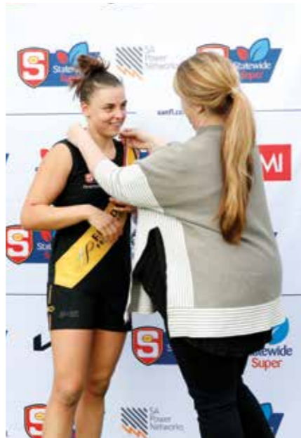
2021 SANFLW Best Player in a Grand Final, Ebony Marinoff.