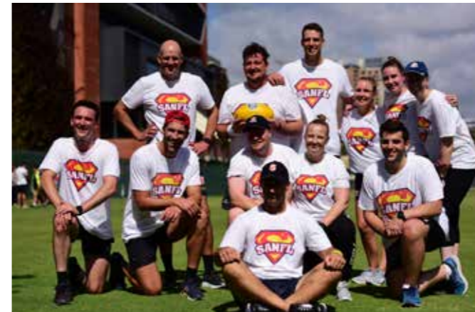
(Left) SANFL's Stadium Showdown AFL 9's team. (Right) The Amazing Race team challenge.