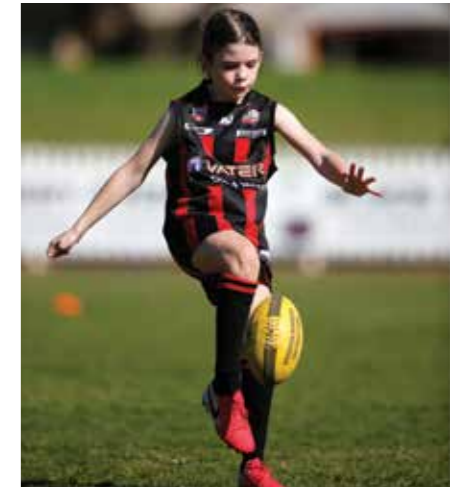
Action from the 2021 National Pharmacies SANFL Juniors Competition.

The success and continued growth of National Pharmacies SANFL Juniors would not be possible without the tremendous work of all the dedicated club volunteers and 400-plus umpires, many of whom are also still SANFL Juniors players themselves and umpire in the younger grades.