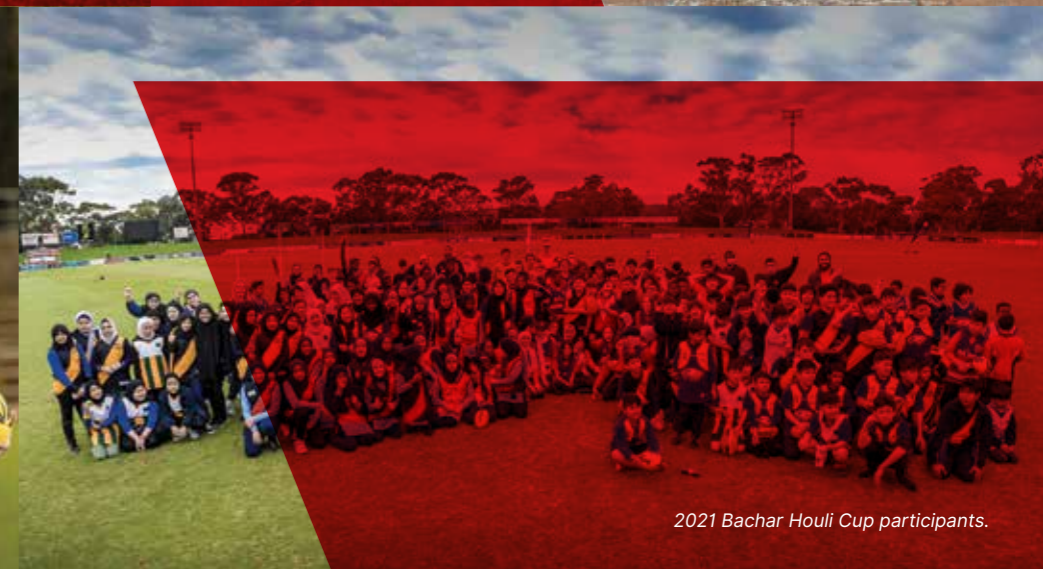
2021 Bachar Houli Cup participants.