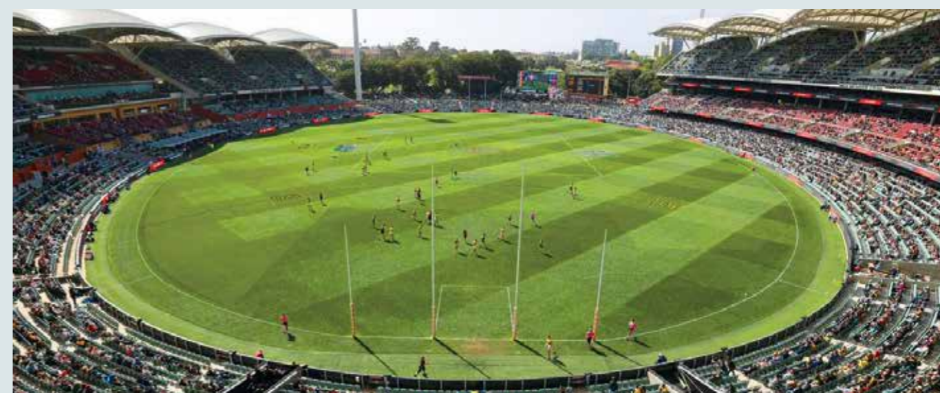
A panoramic view of Adelaide Oval on 2021 SANFL Grand Final day.