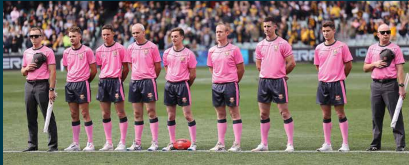
(Below) SANFL Umpires line up for the national anthem ahead of the 2021 SANFL Statewide Super League Grand Final.

Season 2021 marked several significant achievements for the SANFL Umpiring department, highlighted by an umpiring style aimed at making SANFL football an attractive brand to watch.