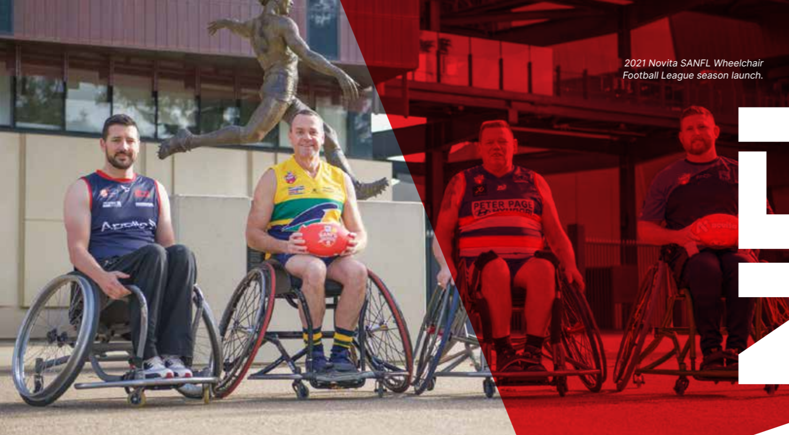
2021 Novita SANFL Wheelchair Football League season launch.