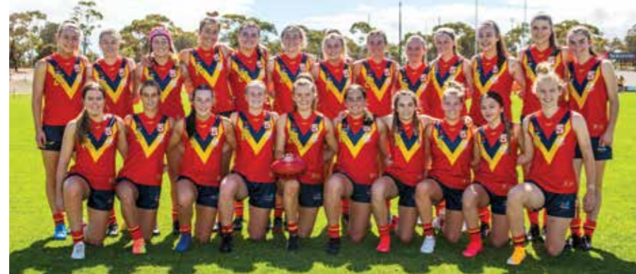
(Above) 2021 SA U19 State Team.

A five-game series in August and September rewarded the best talent at U14 and U16 level while the senior stars of SANFLW showcased their skills in the annual SANFLW All-Stars match.