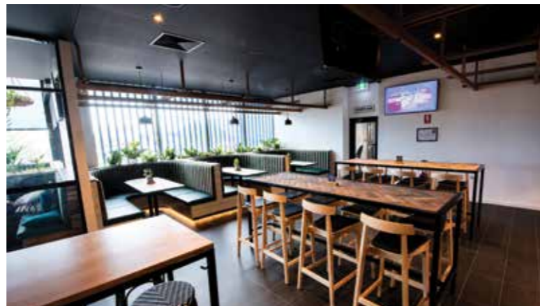
The Mosaic Hotel

As of March 2021, SANFL brought the management of this membership product in-house and now has full responsibility of the marketing, promotion, communication, and customer service to the membership base.