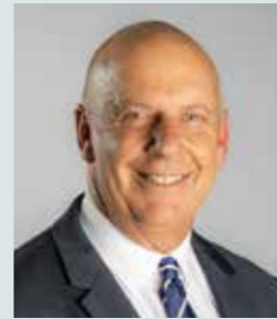
Peter Lindner Commissioner