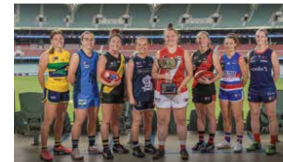
2021 SANFL Statewide Super Women's League season launch.