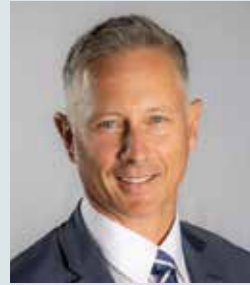
Luke McCabe Commissioner