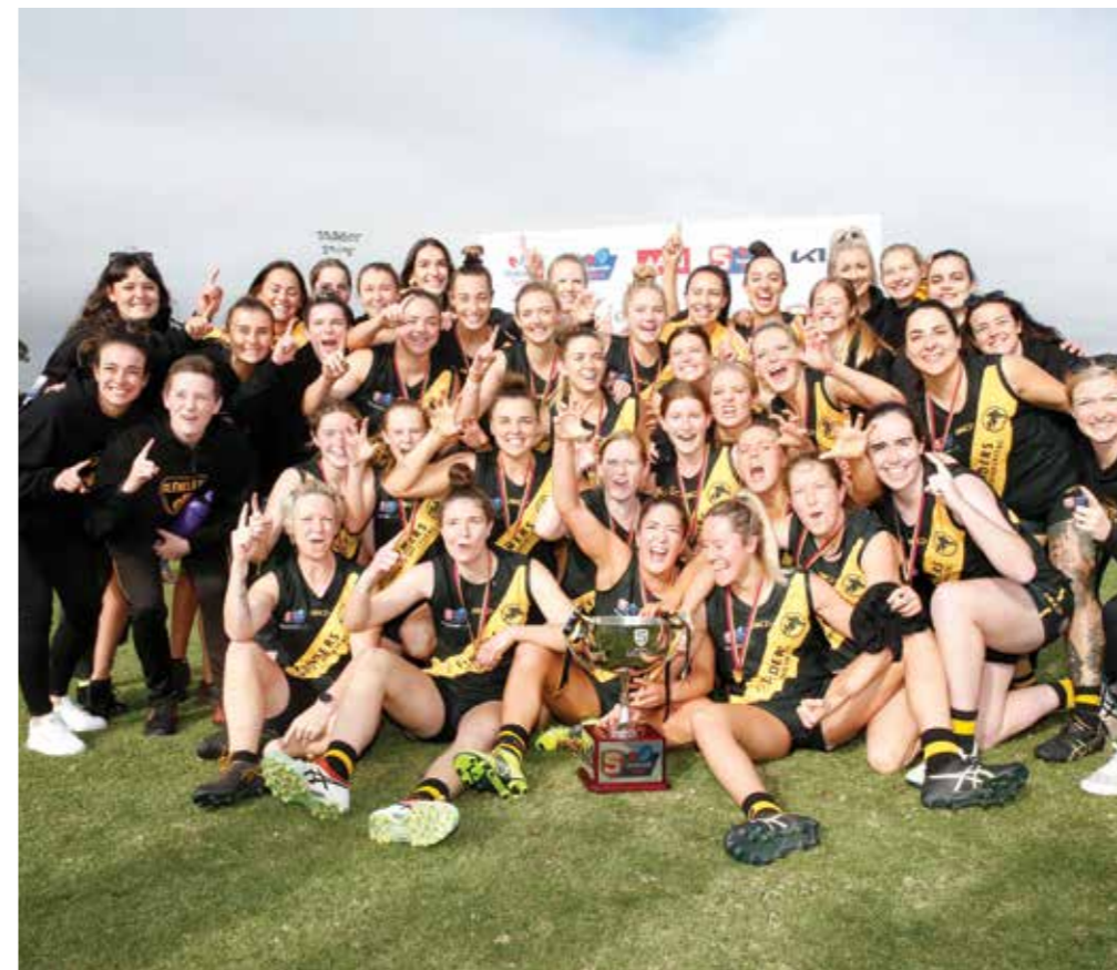
2021 SANFL Statewide Super Women's League winners, Glenelg FC.