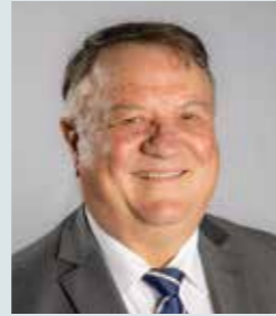
Tom Zorich Commissioner