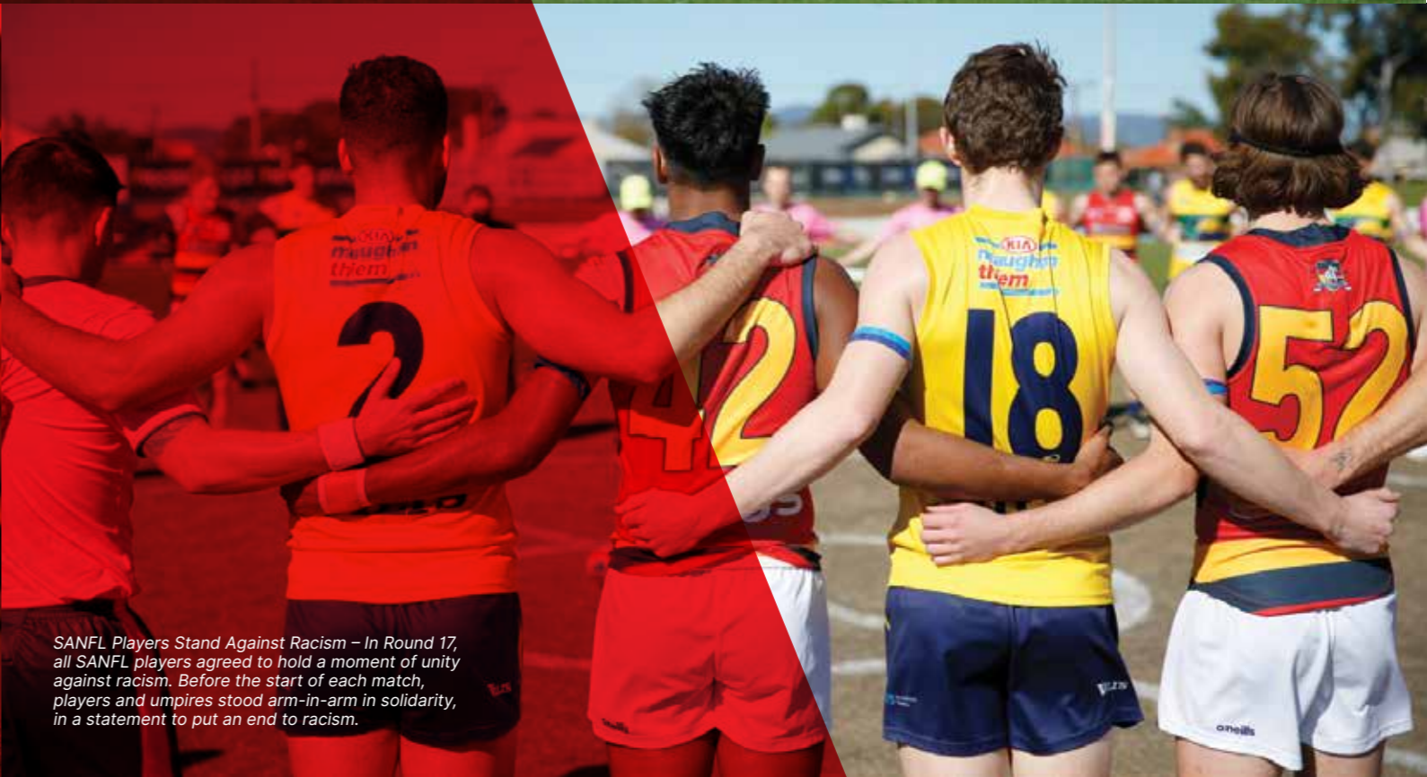
SANFL Players Stand Against Racism – In Round 17, all SANFL players agreed to hold a moment of unity against racism. Before the start of each match, players and umpires stood arm-in-arm in solidarity, in a statement to put an end to racism.