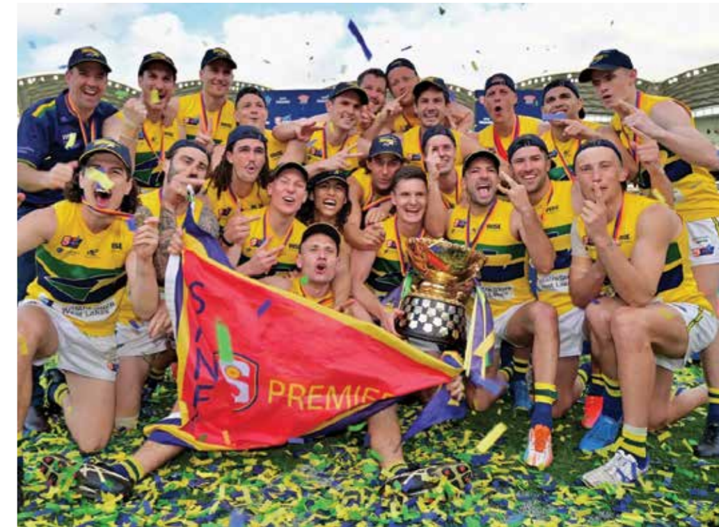
2021 SANFL Statewide Super League winners, Woodville-West Torrens FC.

Becoming the first team since Norwood in 2014 to win the premiership from the