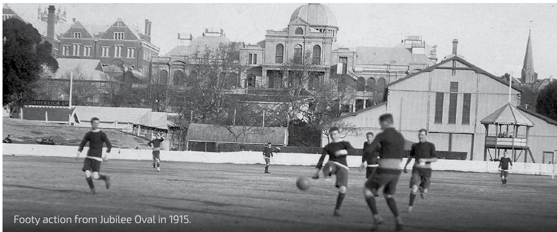
Footy action from Jubilee Oval in 1915.

One hosted a grand final. The other is an arena more often used for equestrian, dog shows and monster trucks. They have been long lost to SA footy but Jubilee Oval and Wayville Oval played important roles in the development of our game.