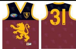
SMOSH West Lakes