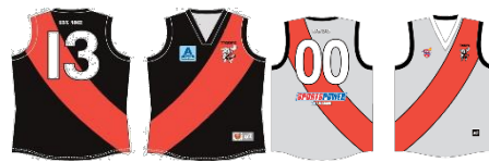
Tea Tree Gully