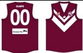
Colonel Light Gardens