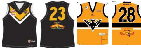
Brighton Districts & Old Scholars