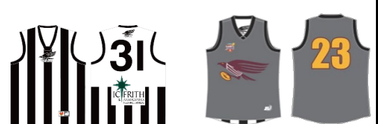
Payneham Norwood Union