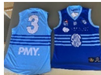
Sacred Heart OC