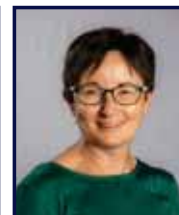
Janet Finlay Commissioner