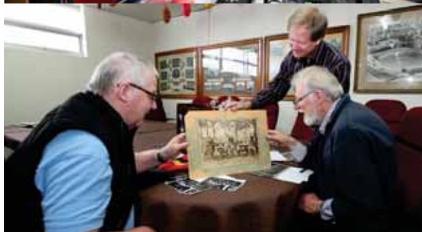
Volunteers at the SANFL History Centre in Bowden.