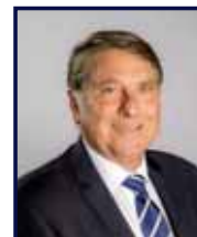
Bill Moody Commissioner