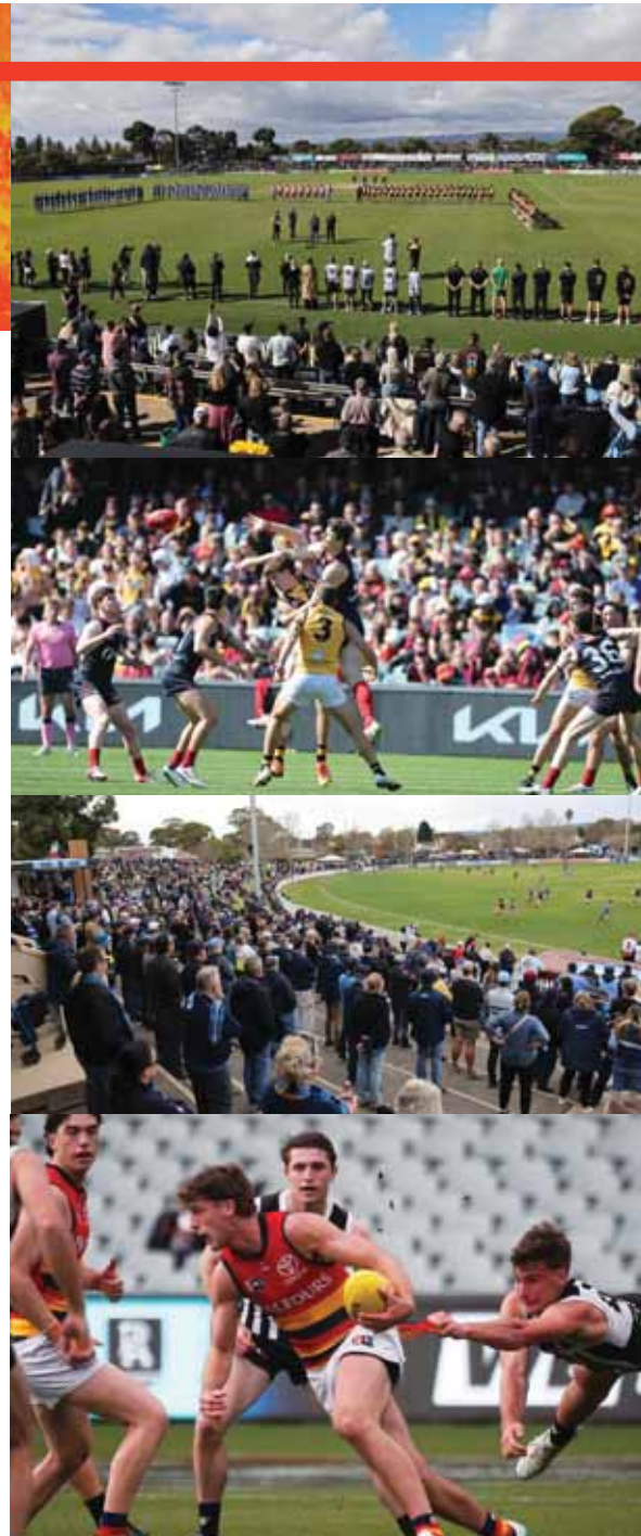
From top right: The Anzac Day ceremony at Strathmore Stadium before the Glenelg v Sturt clash; The first bounce of the Hostplus SANFL League Grand Final; A massive crowd of 6911 attends Thomas Farms Oval at Unley for the Sturt v Norwood King's Birthday clash; Adelaide and Port Adelaide players contest the SANFL Showdown at Adelaide Oval. Both clubs have welcomed changes to their club regulations for 2025.