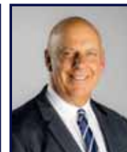
Peter Lindner Commissioner