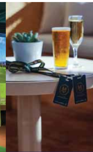
Left - SANFL's XGolf facility at West Lakes in full swing. Right - Enjoying the benefits of the Adelaide Oval Ultimate Football Membership.