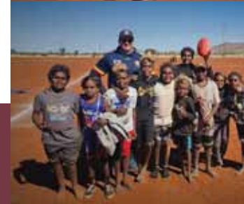
Top: Participants at the Don McSweeney Cup Above: Action from the SANFL APY League, including a match for local children facilitated by SANFL staff.