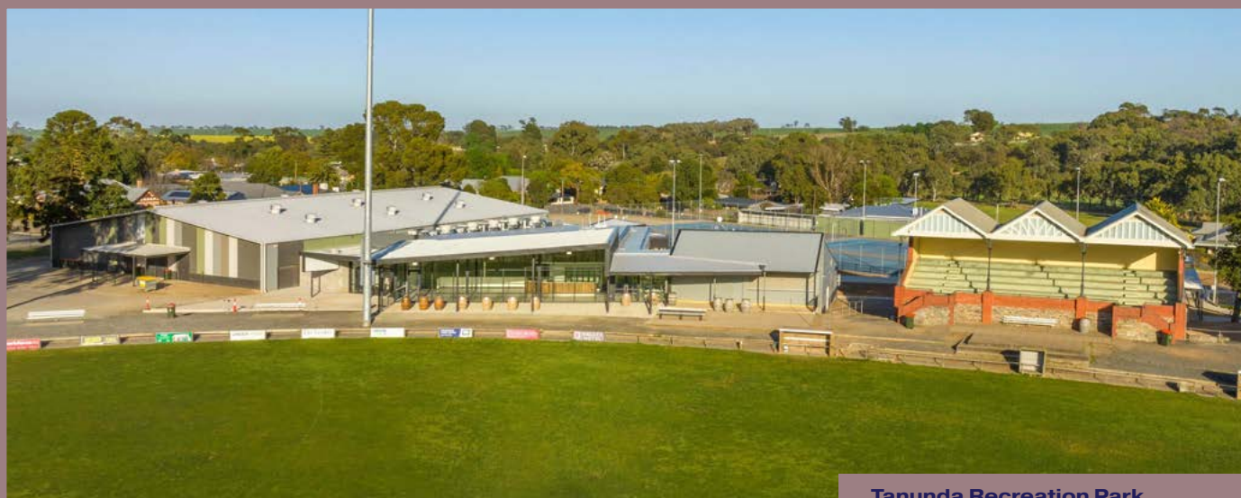
Tanunda Recreation Park

Refer to section five for information related to funding amounts and co-investment requirements.