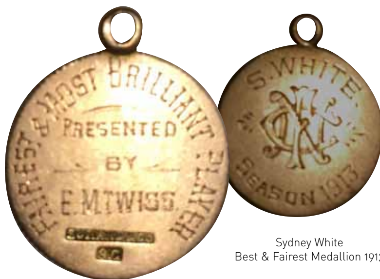
Sydney White Best & Fairest Medallion 1913