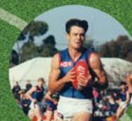
COWHAM SONS OF EDEN