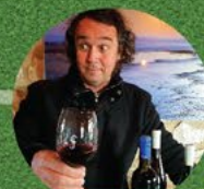
HOOPER CAPE JAFFA