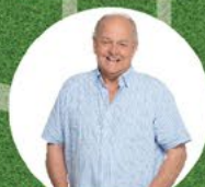
KEELAN THE PAWN