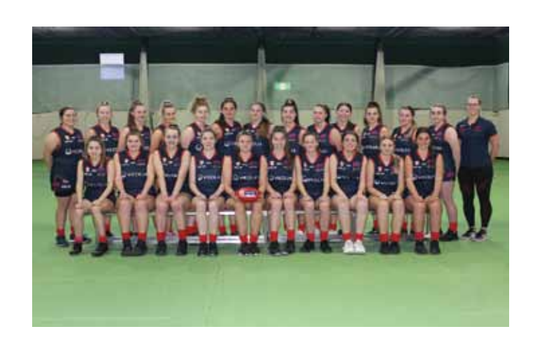
U17 Girls Squad.