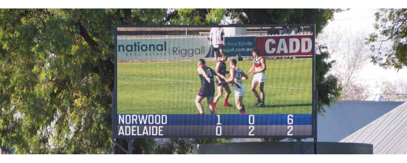
Coopers Stadium Superscreen

I would also like to thank several independent committee members who have been working closely with the board, CEO and staff members to achieve our goal of being the leading club in the SANFL. So, a very big thank you to the;