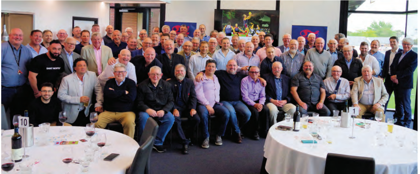
The first ever Past Players and Officials lunch in the Wolf Blass Community Centre.

On behalf of the board and management I have great pleasure in presenting the Norwood Football Club Incorporated and controlled entities financial report for the year ending 31 October 2020.