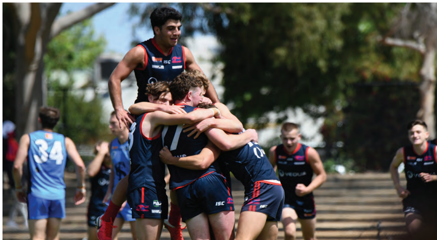
Norwood's Under 18s celebrate in the 2020 Grand Final.

Despite the much talked about challenges that everyone has faced due to the COVID-19 pandemic, the club was committed to doing all that it could to continue to identify local talent and support the development of our underage players in our metropolitan and regional zones. Although every squad was impacted in some way, we still managed to deliver programs for our U13s, U14s, U15s Boys Squads, U15s & U17s Girls Squads, U15s Country Squad as well as U16s and U18s Centre of Excellence Squads. This was only possible due to the support and commitment of our fantastic underage coaches, medical staff and volunteers.