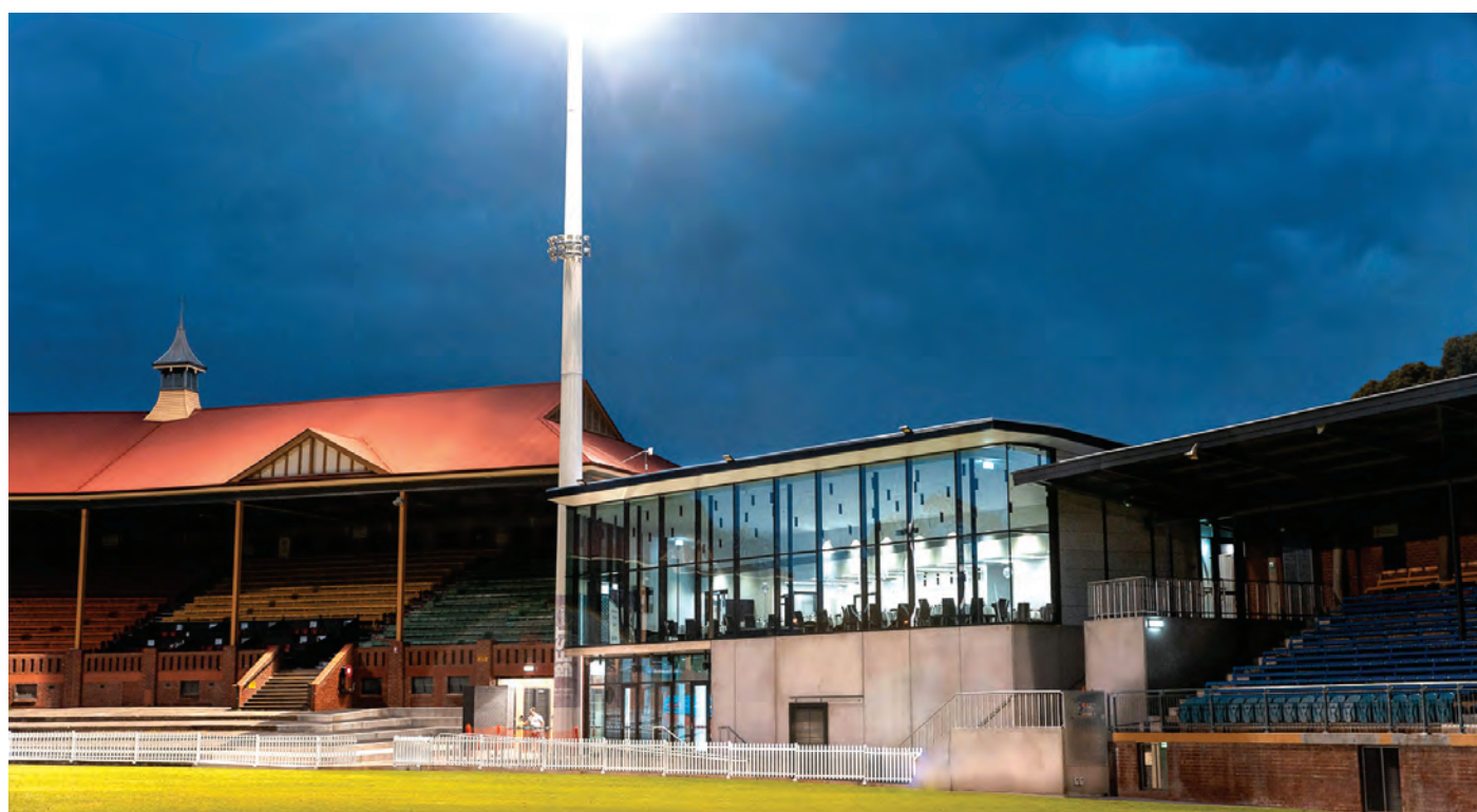
The new Wolf Blass Community Centre at Coopers Stadium.