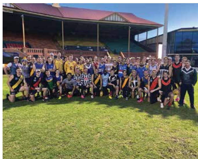
The Norwood Senior men donning their junior club guernseys.