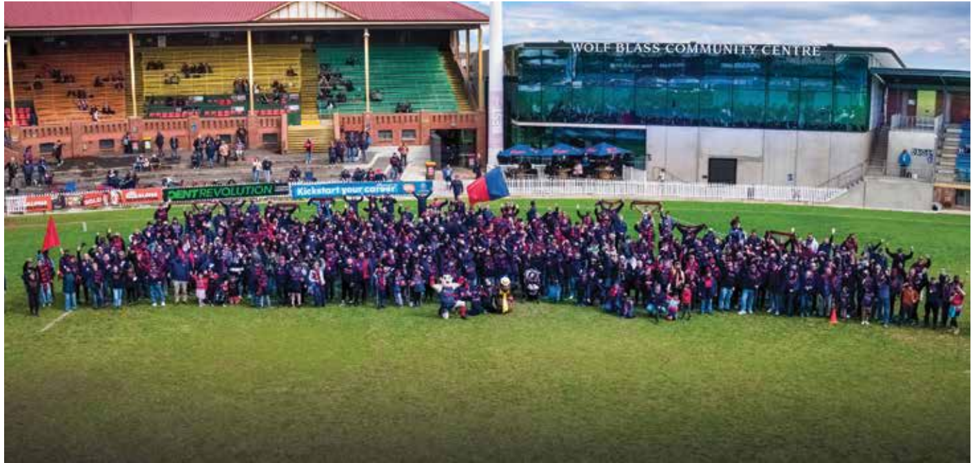
The Fortis in Procella Army gather on Norwood Oval after marching as one.

In season 2021 we welcomed a new partner to the Norwood Football Club in Apelle Pty Ltd who commenced a three year partnership as a Platinum sponsor alongside Coopers Brewery.