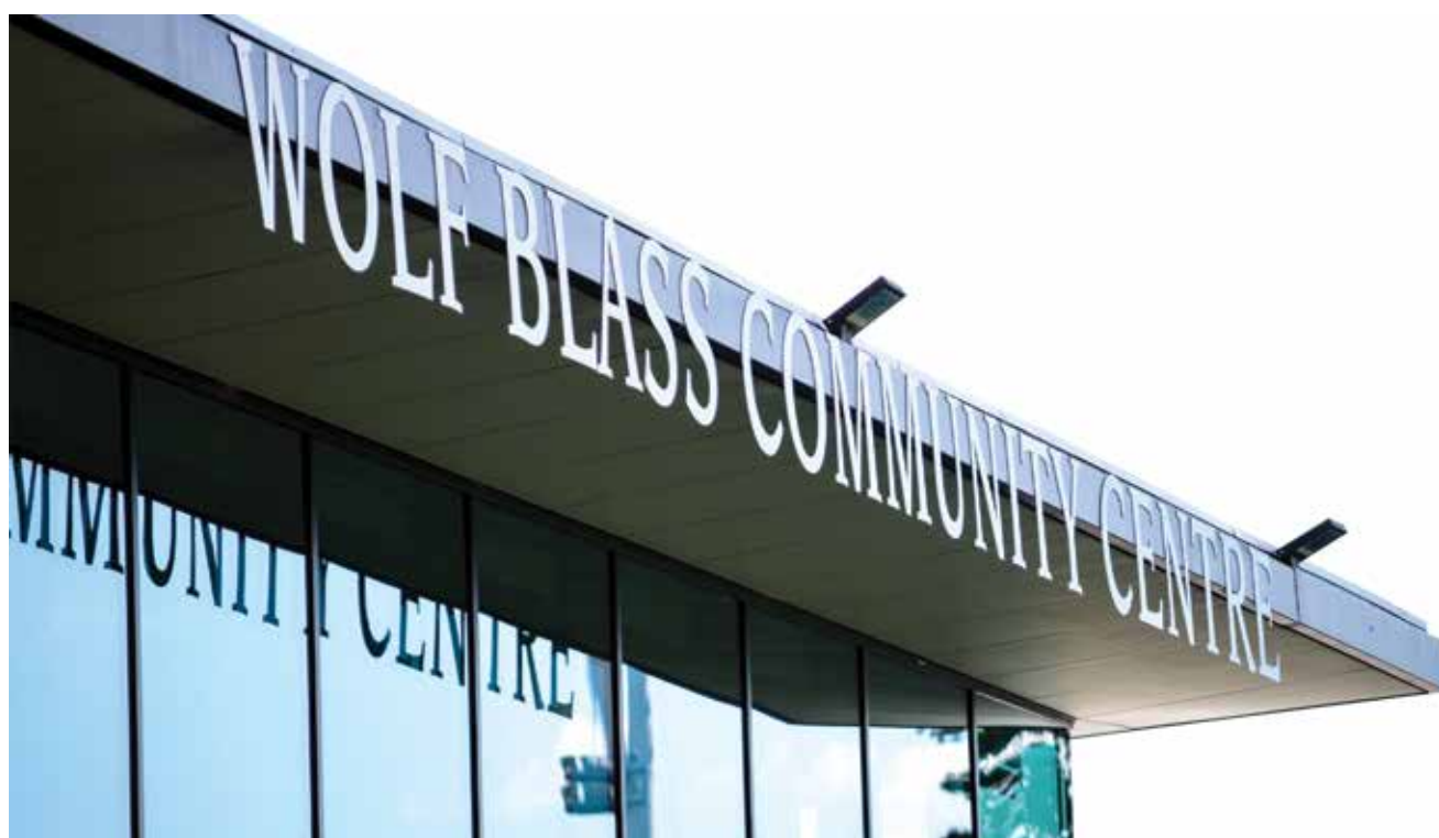
The Wolf Blass Community Centre at Coopers Stadium.