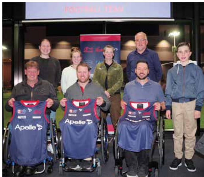
WHEELCHAIR TEAM: The 2021 Norwood Football Club Wheelchair Team.