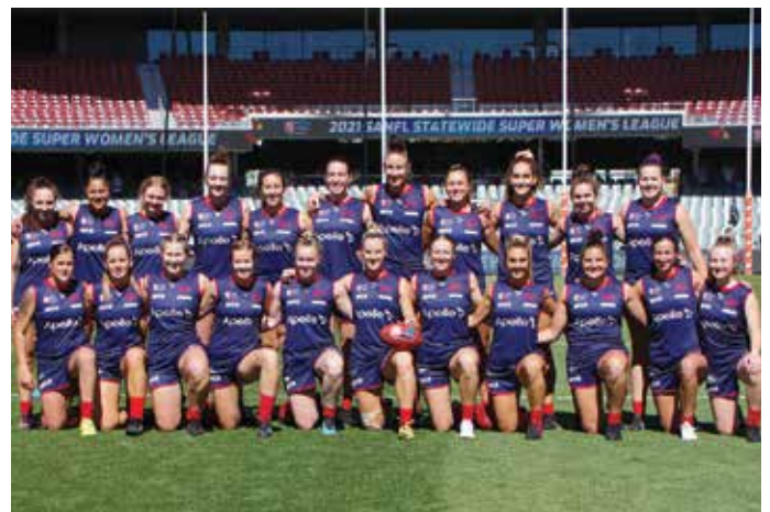
The Lady Legs gather for a team photo ahead of their first ever clash on Adelaide Oval.