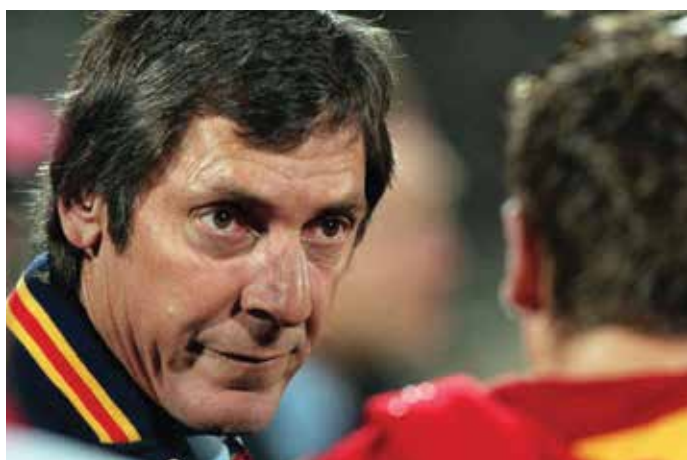
Russell Ebert 1949 – 2021

On behalf of the Norwood Football Club, we were deeply saddened by the passing of South Australian Football Legend, Russell Ebert.