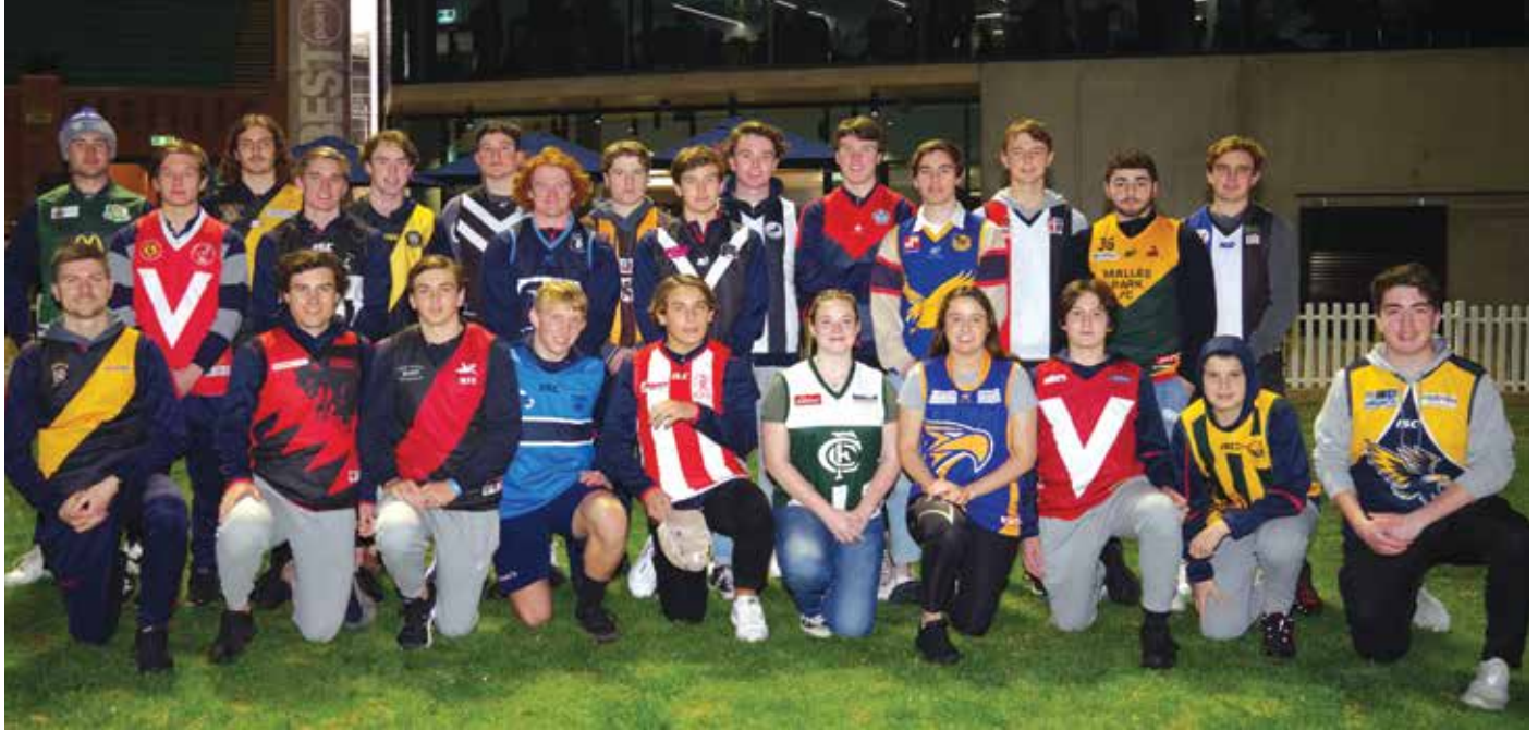
Eyre Peninsula Round at The Parade - Young men and women modelling all the jumpers from all the local clubs across Norwood's zone on the Eyre Peninsula.

Season 2021 saw all of the squads once again navigate their way through the challenges brought about by COVID-19. With the 'new norm' forcing everyone to be more adaptable and tolerant our coaches and staff in the underage and women's programs once again embraced the challenges and forged ahead with unwavering commitment.