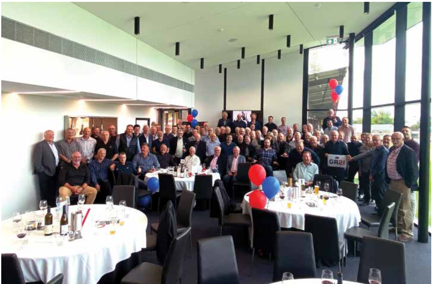
All Past Players and Officials gather for the yearly photo at the Past Players and Officials Lunch.

The Net result of the above entities was a surplus of $1,052,503. If we add back depreciation ($367,731), remove the gain of the value of gaming entitlements ($120,085) and remove the net surplus of Build the Fort activities ($477,696), the result is a surplus of $822,453.