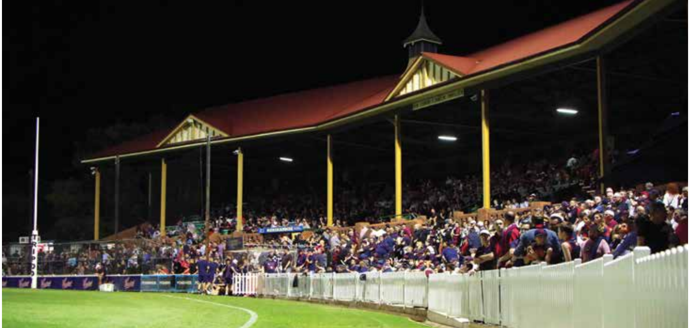
A packed house at Coopers Stadium watching Norwood against Port Adelaide in Round One.

On behalf of the board and management I have great pleasure in presenting the Norwood Football Club Incorporated and controlled entities financial report for the year ending 31 October 2021.