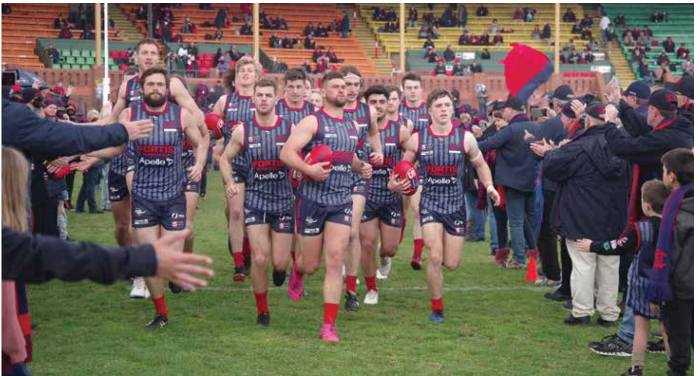
The League team runs out through the guard of honour set by the Fortis in Procella Army.