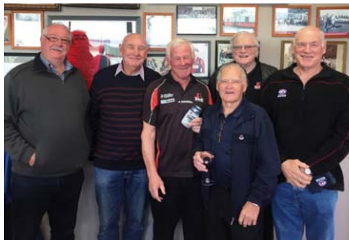
Six Past Players who caught up at the Port Adelaide home match this year.

A reminder to all Past Players & Officials to come & bring an ex-team mate along who haven't been attending our home games. It doesn't matter if you've been away from Richmond Oval "City Mazda Stadium" for five minutes or five years please come back & cheer on our Bloods. Your support for our club & players is greatly appreciated.