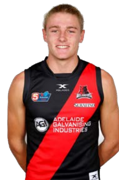
ELLIOT DUNKIN BILL DOWNS MEMORIAL TROPHY - MOST IMPROVED