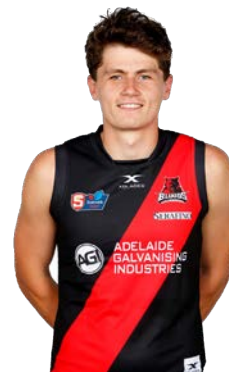
PATRICK FAIRLIE KEITH REYNOLDS MEMORIAL TROPHY