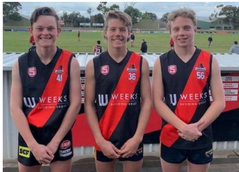
Players from our Young Bloods Academy

The Westonians look forward to a great year in 2021 and would like to encourage everyone to sign up as a member.