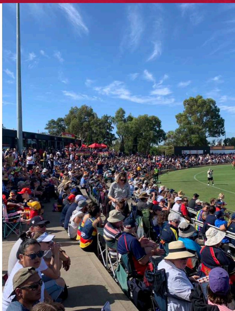
Crowd at Hisense Stadium for one of our AFLW matches