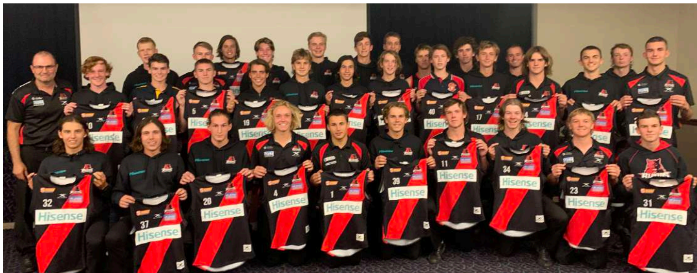
Under 16s squad

We were able to bring the group back after the COVID-19 shutdown for a trial match against Norwood which was a good way to see the group back together and assist with preparation for season 2021.