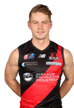
CONNOR FAIRLIE BILL DOWNS MEMORIAL TROPHY - MOST IMPROVED