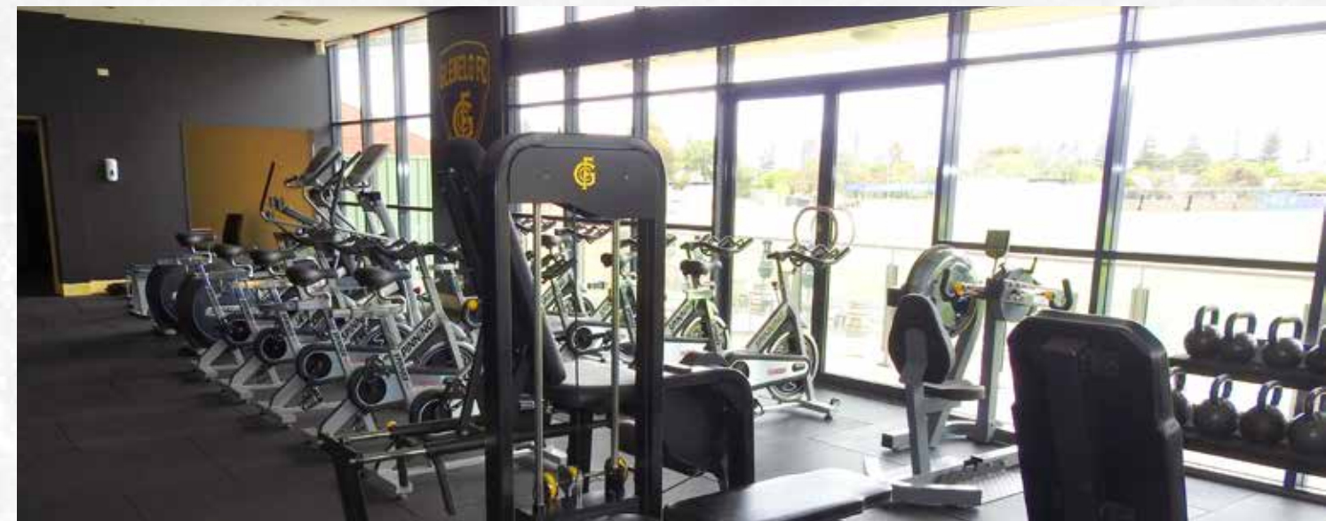
PHOTO: Glenelg players' new gym.

"Now you don't feel like you're breathing in 20 years worth of dust. It looks so much more professional."