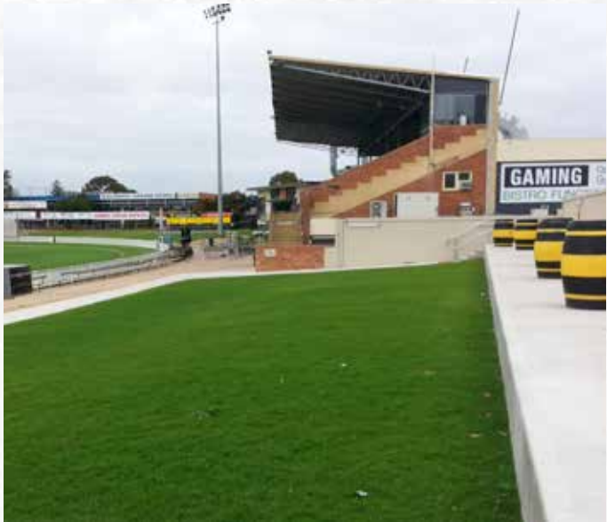
PHOTO: The viewing area on the western wing where the HY Sparks Stand used to be.