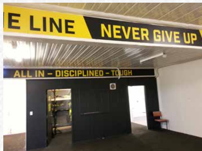
PHOTO: Glenelg Players' Changerooms

"The Club must provide first class facilities to enable all players to maximise their performances. They are going to be well coached, they are going to have a great gym, sensational oval, great changerooms and we've got Thebarton Oval for pre-season."