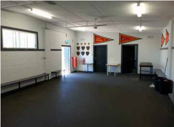
PHOTO: The opposition rooms