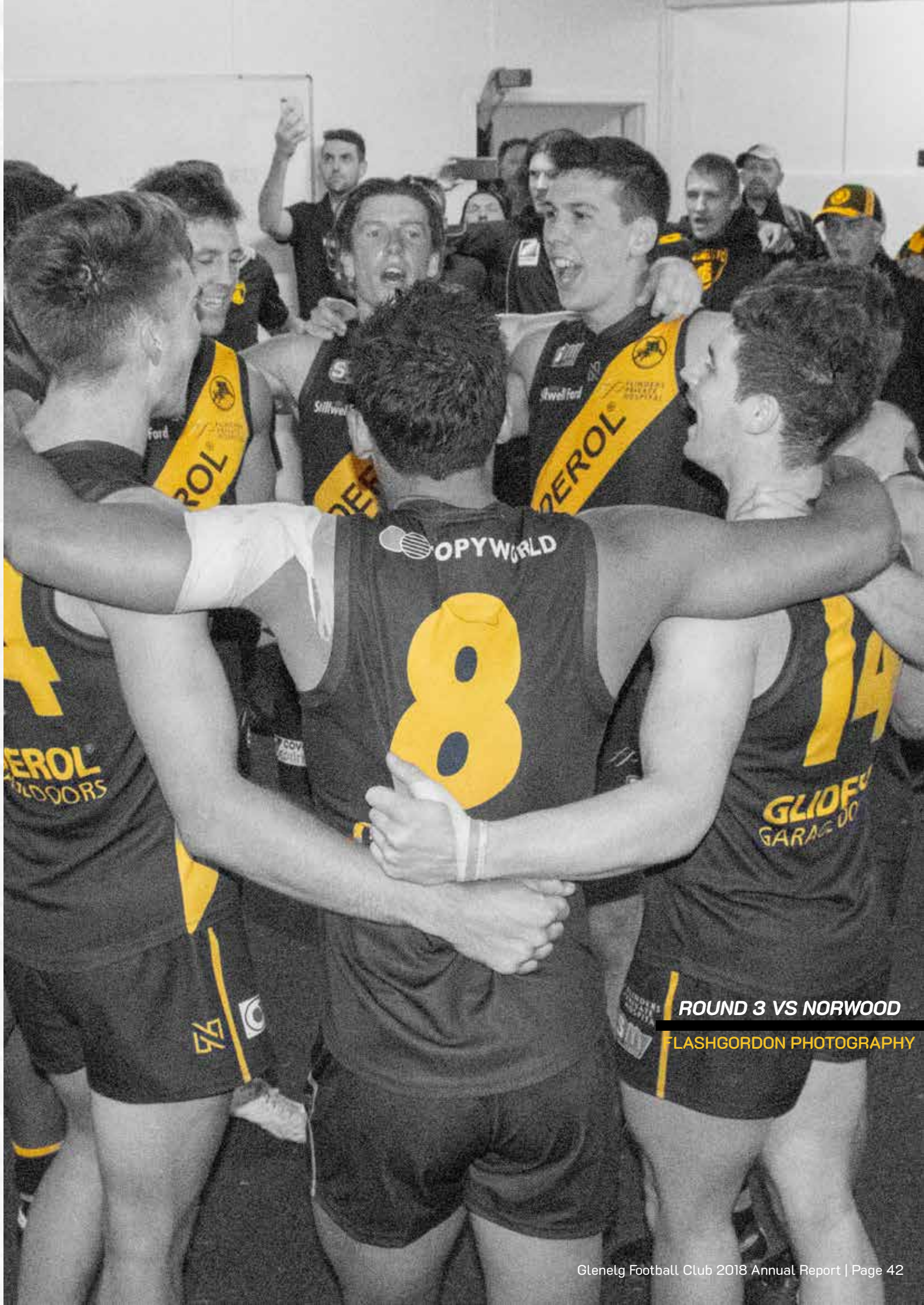
ROUND 3 VS NORWOOD