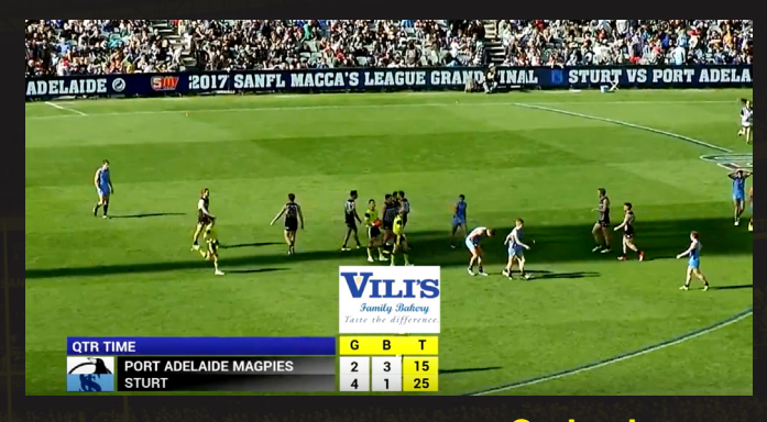
Qtr break scores