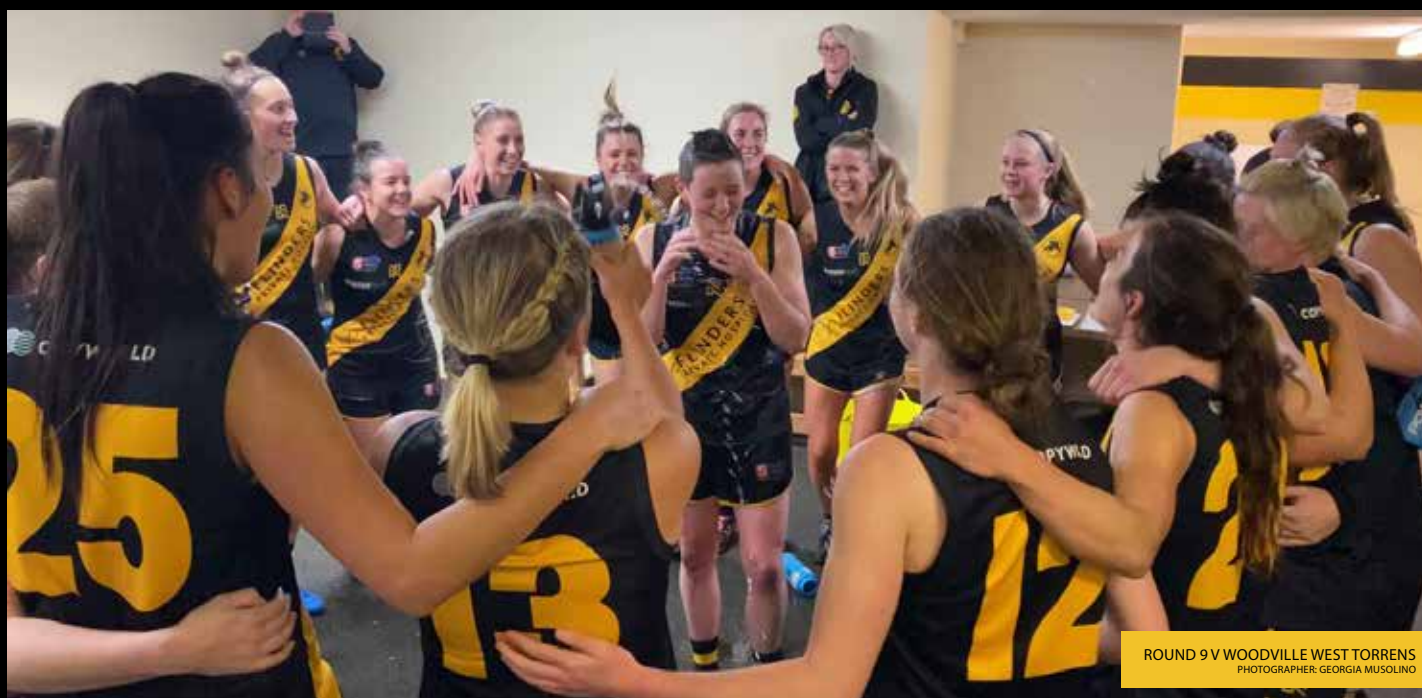
ROUND 9 V WOODVILLE WEST TORRENS