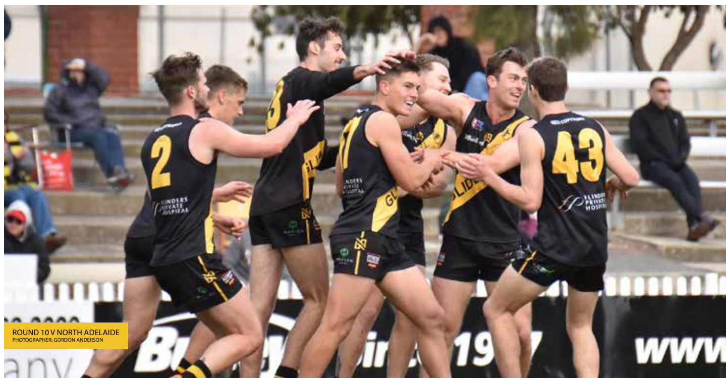
ROUND 10 V NORTH ADELAIDE