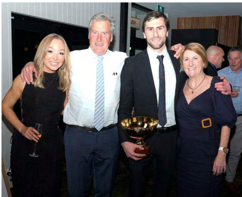
THE PROUD FAMILY