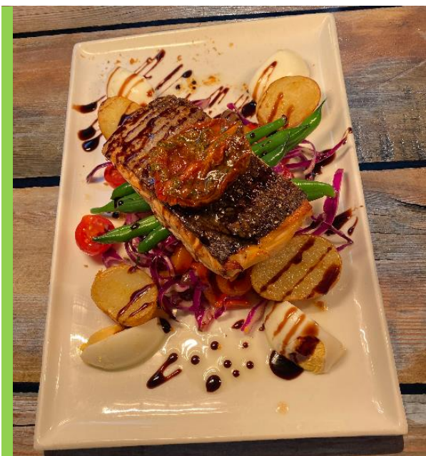
Tasmanian Salmon Niçoise