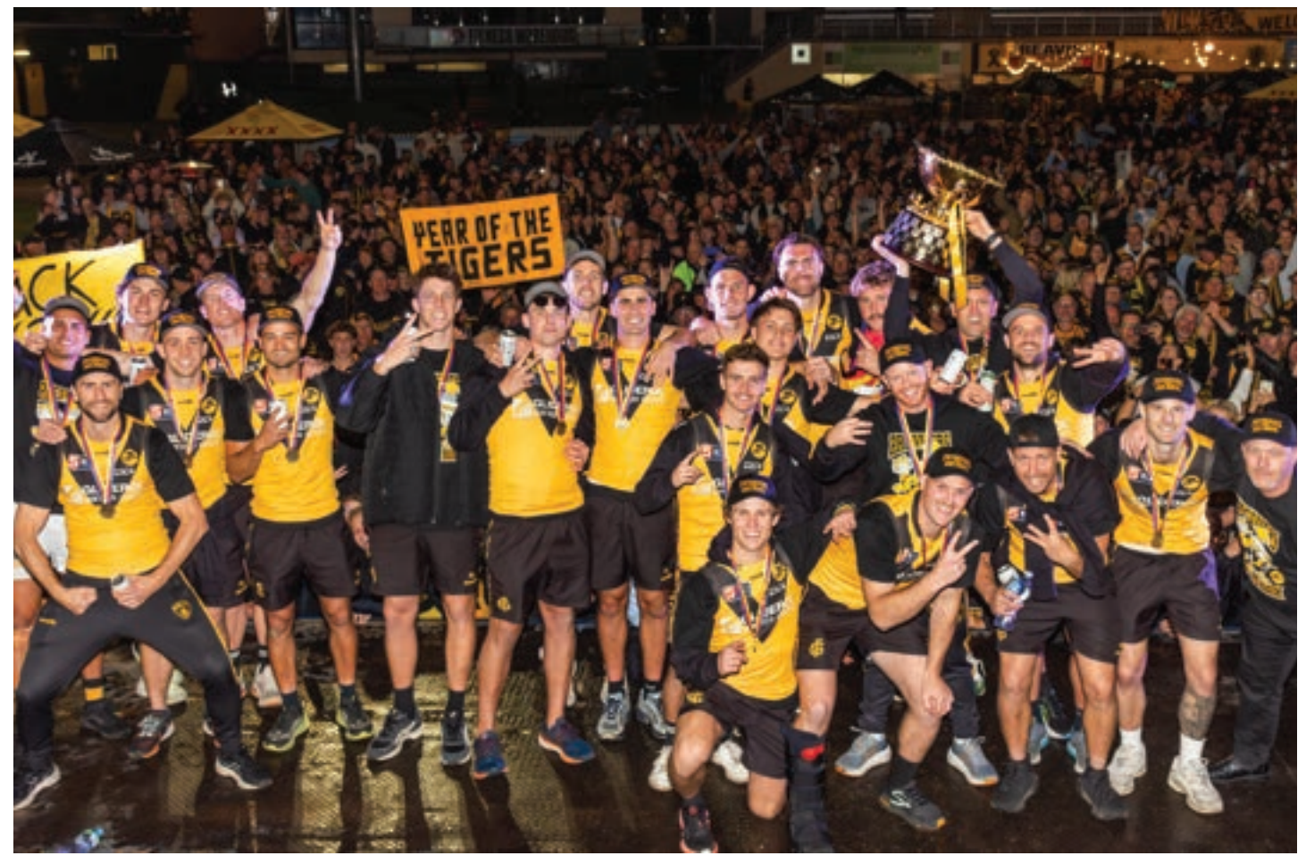
It was Year of the Tigers again and more then 5000 loyal fans were back at the Bay after an unforgettable grand final to celebrate back-to-back flags with the jubilant players.